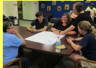
Fatherhood Initiative "Real Fathers are Dads"