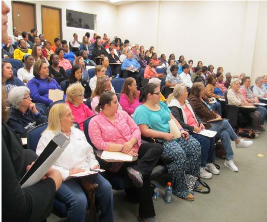
Spring Early Childhood Conference